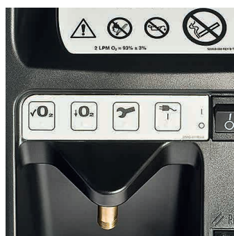
Front label with easy to read pictograms