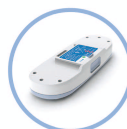
Inogen One® G3 Single Lithium Ion Battery* Up to 4 hours run time Item #BA300