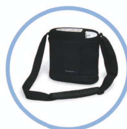
Inogen One® G3 Carry Bag* Item # CA300