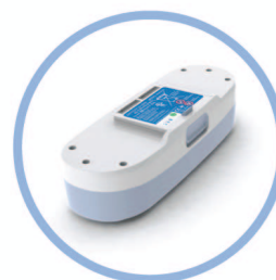
Inogen One® G3 Double Lithium Ion Battery** Up to 8 hours run time Item #BA316