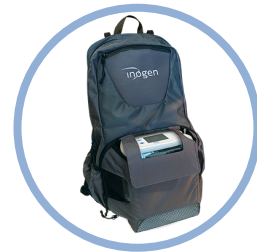
Inogen One G5 Backpack** Item #CA-550