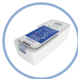
Inogen One ® G5 Extended Life Lithium Ion Battery** Up to 13 hours run time Item #BA-516