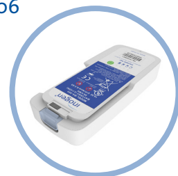
Inogen One G5 Lithium Ion Battery* Up to 6.5 hours run time Item #BA-500