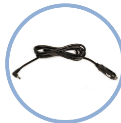
Inogen One G5 DC Power Cable* Item #BA-306