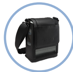
Inogen One G5 Carry Bag* Item #CA-500